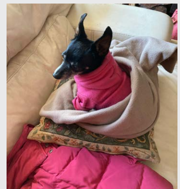
A cozy Pi